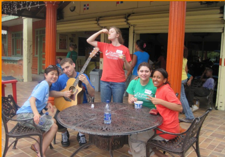
Team HERO 2010 taking a break after teaching the morning

Our mission is to inspire love, peace and unity through the power of music. By establishing specialized music programs we hope to diminish adversity in less developed communities. We believe that through music we can bring social change to societies who have been corrupted by the circumstances of this world. We also believe that through music we can raise awareness about the current inspire others to make a difference.