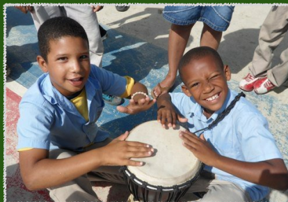
Students play djembe during recess