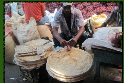
Dominican man selling cassava bread at the market place at the border of Haiti and the D.R.